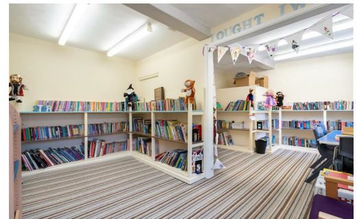
White Roses Cottage Moreton in Marsh Gloucestershire GL56 0BN